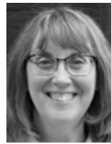
SHARI \ SAILING